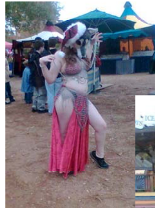
Fox, the other White Meat!