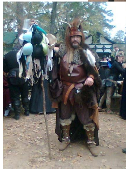
Victoria's Secret never had a chance.

Do you have something you can't un-see? Email it to us at trfwtf@yahoo.com !