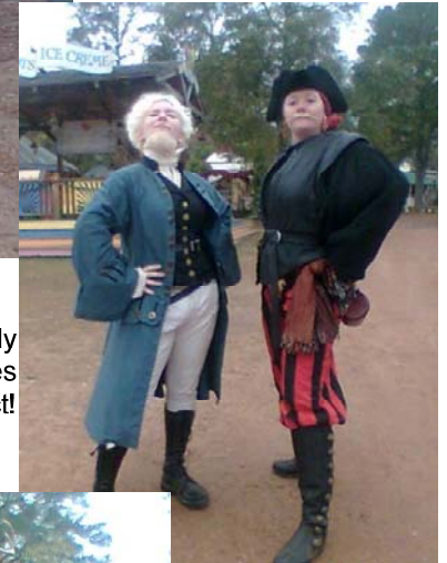
Forget about historically accurate, these costumes are anatomically correct!